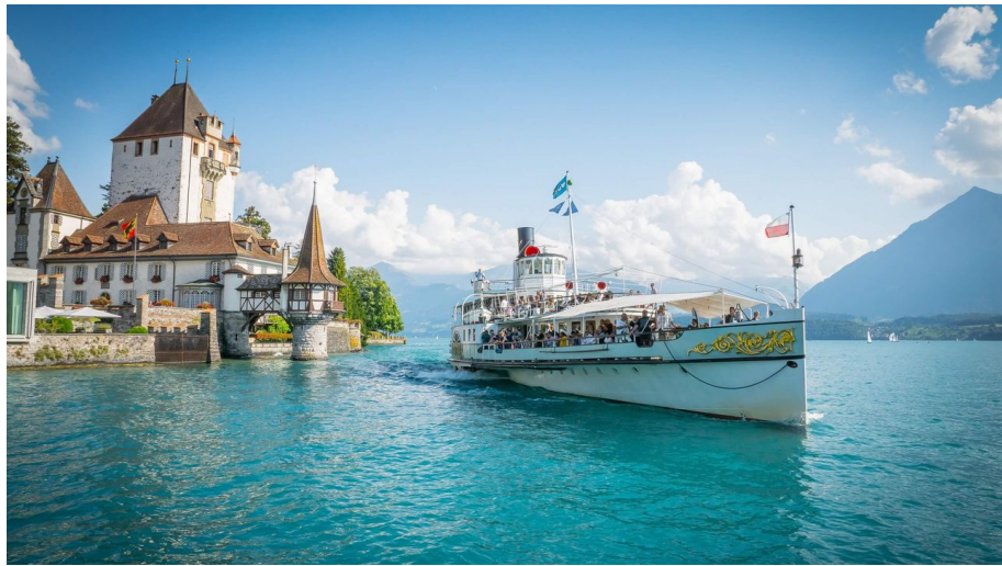
Tourismus-Organisation Interlaken, Interlaken Tourismus - web@interlaketourism.ch