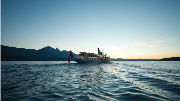
BLS AG, Schifffahrt - web@interlaketourism.ch