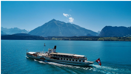
BLS Schifffahrt AG, Interlaken Tourismus - web@interlaketourism.ch