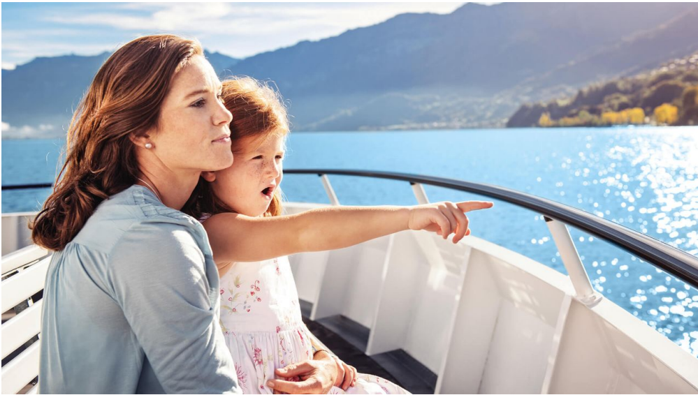
BLS AG, Schifffahrt, Interlaken Tourismus - web@interlaketourism.ch