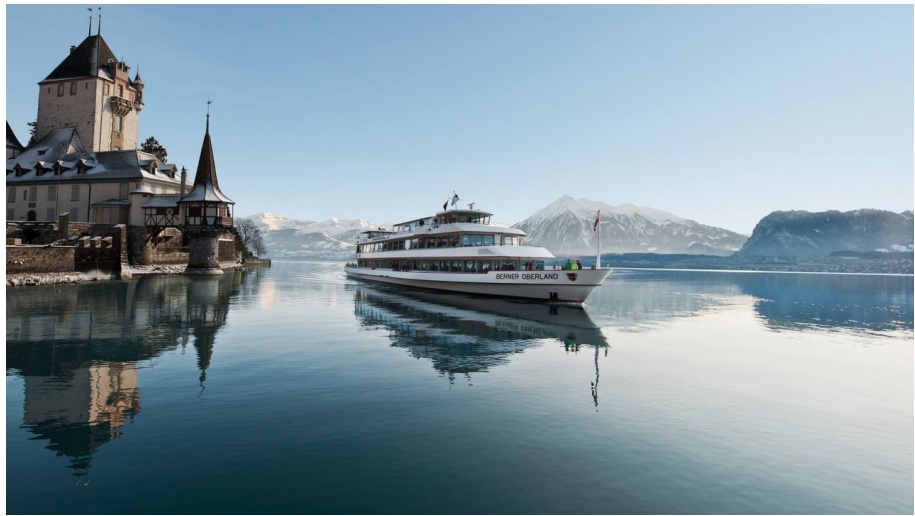
Tourismus-Organisation Interlaken, Interlaken Tourismus - web@interlaketourism.ch