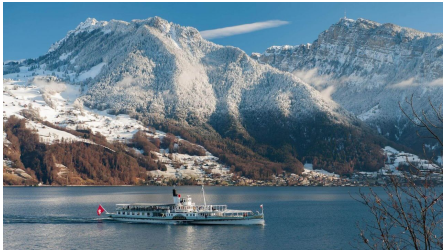
BLS AG, Schifffahrt, Interlaken Tourismus - web@interlaketourismus.ch