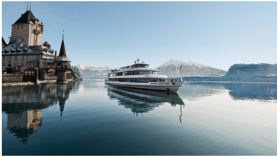
Tourismus-Organisation Interlaken, Interlaken Tourismus - web@interlaketourism.ch