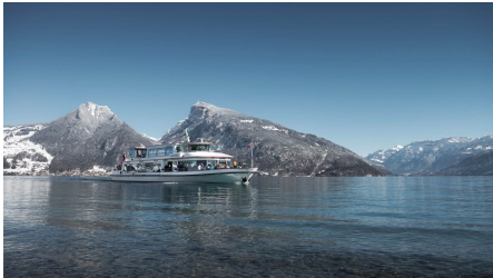
BLS AG, Schifffahrt, Interlaken Tourismus - web@interlaketourism.ch