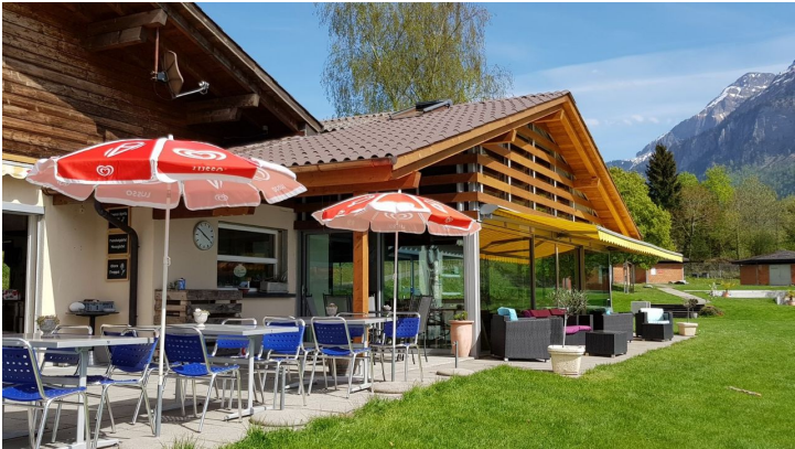
Strandbad Brienz