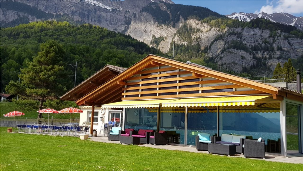
Strandbad Brienz