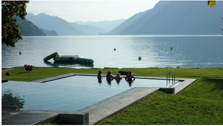
Strandbad Brienz