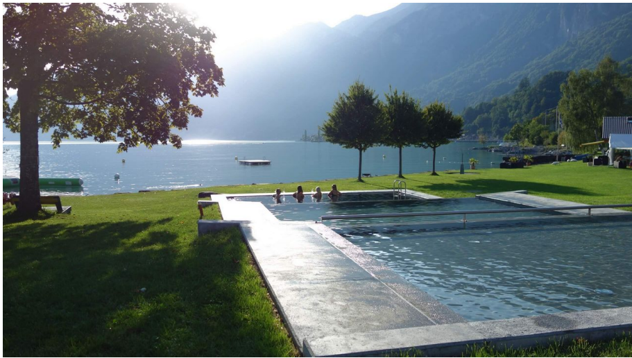
Strandbad Brienzi

outdoor swimming pools Disability Access summer