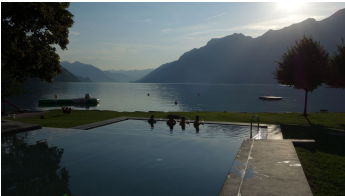
Strandbad Brienz