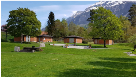
Strandbad Brienz