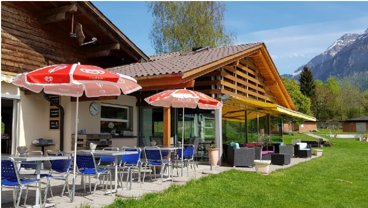
Strandbad Brienz