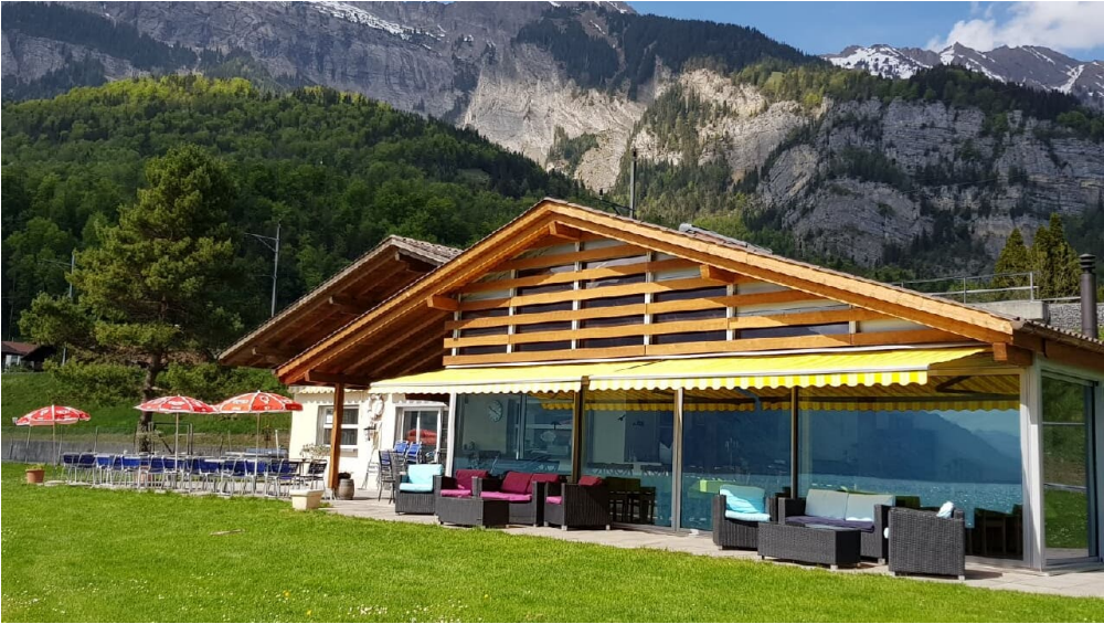
Strandbad Brienz