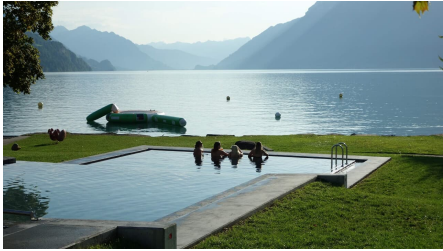
Strandbad Brienz, Interlaken Tourismus - web@interlaktourism.ch