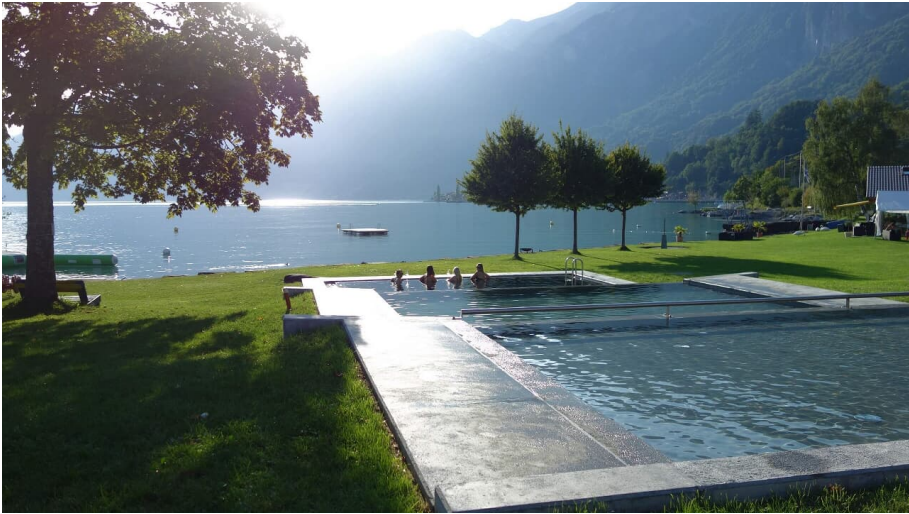
Strandbad Brienzi, Interlaken Tourismus - web@interlaketourismus.ch

outdoor swimming pools Disability Access summer