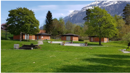
Strandbad Brienz