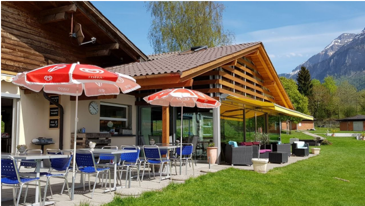
Strandbad Brienz