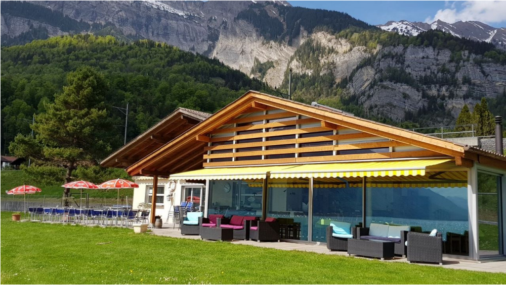
Strandbad Brienz