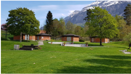
Strandbad Brienz