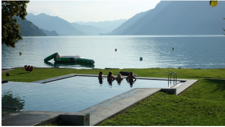
Strandbad Brienz