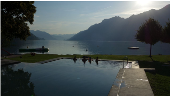
Strandbad Brienz, Interlaken Tourismus - web@interlaktourism.ch