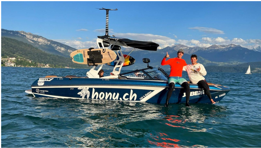
Honu Wassersportcenter

cayak / canoe / boat waterski/wakeboard/(wind)surfing SUP Disability Access summer