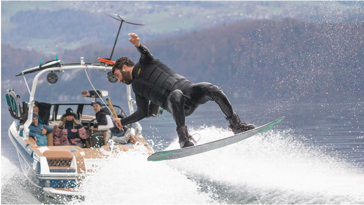
Honu Wassersportcenter, Interlaken Tourismus - web@interlaketourism.ch