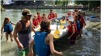
Honu Wassersportcenter, Interlaken Tourismus - web@interlaketourism.ch