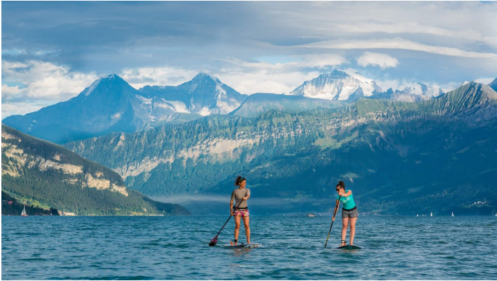
Honu SUP Center