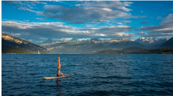
Honu Wassersportcenter, Interlaken Tourismus - web@interlaketourism.ch