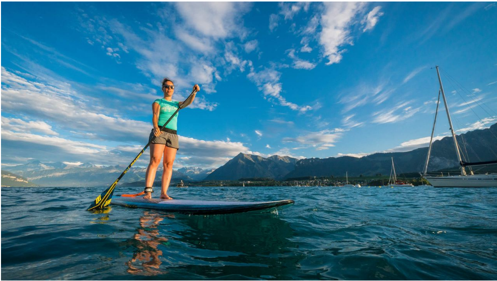
Honu Wassersportcenter, Interlaken Tourismus - web@interlaketourism.ch