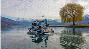
Honu Wassersportcenter, Interlaken Tourismus - web@interlaketourism.ch