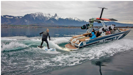
Honu Wassersportcenter, Interlaken Tourismus - web@interlaketourism.ch