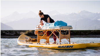
Honu Wassersportcenter, Interlaken Tourismus - web@interlaketourism.ch