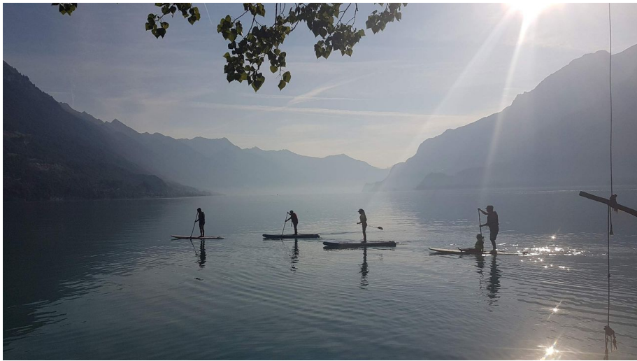
SUP fit&fun / TCS Camping