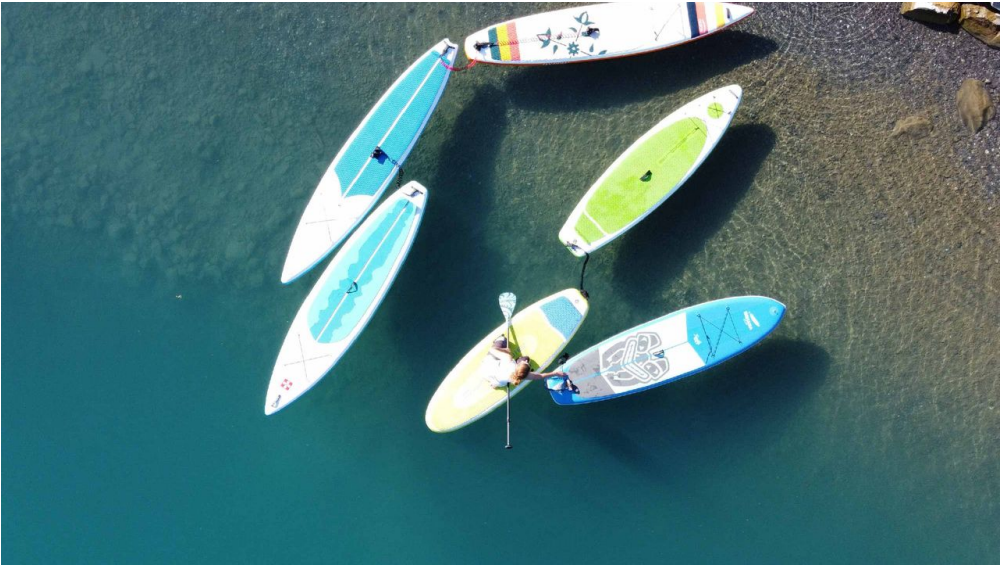
SUP fit&fun / TCS Camping

1 May – 30 September 2020 10.00 – 20.00 h if the weather is nice