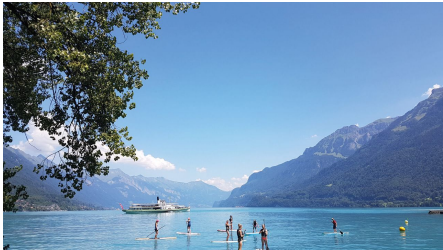
SUP fit&fun