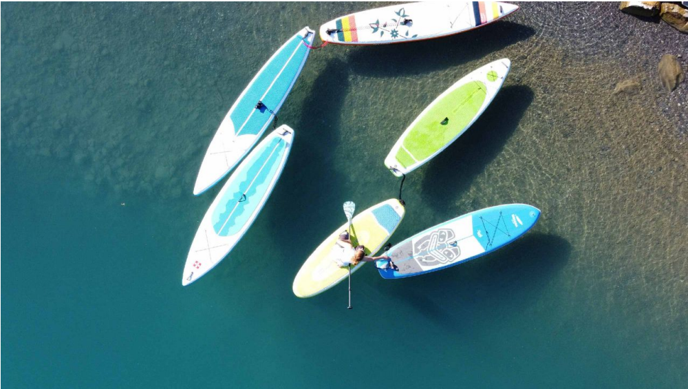
SUP fit&fun / TCS Camping, Interlaken Tourismus - web@interlaketourism.ch

1 May – 30 September 2020 10.00 – 20.00 h if the weather is nice