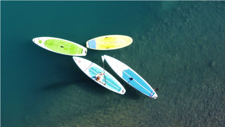
SUP fit&fun / TCS Camping