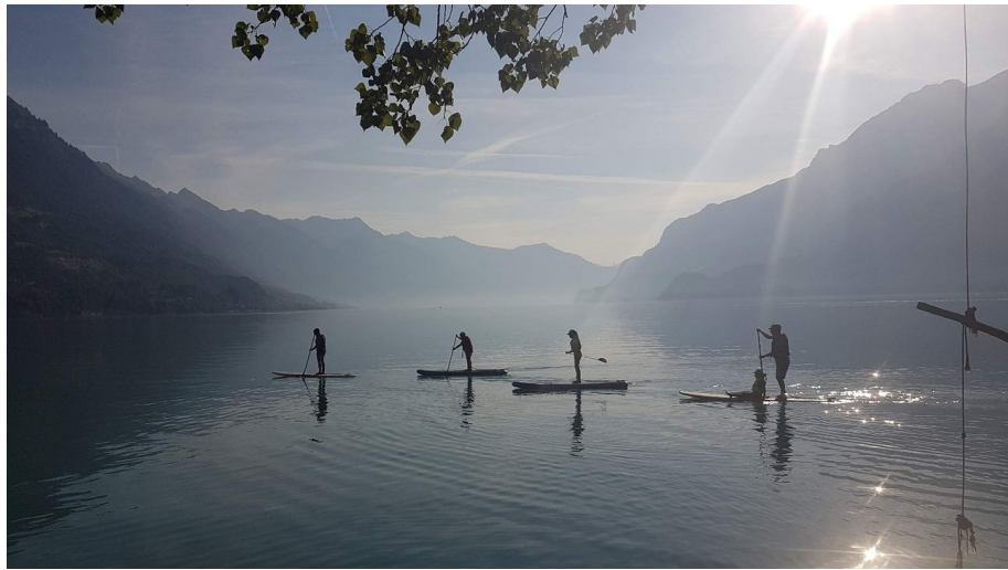
SUP fit&fun / TCS Camping, Interlaken Tourismus - web@interlaketourism.ch