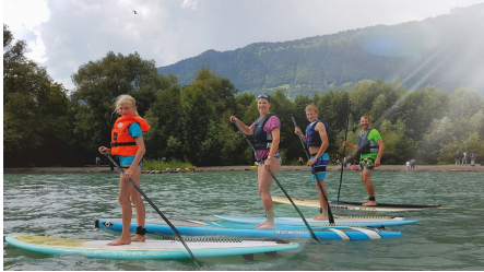
SUP fit&fun / TCS Camping, Interlaken Tourismus - web@interlaketourism.ch