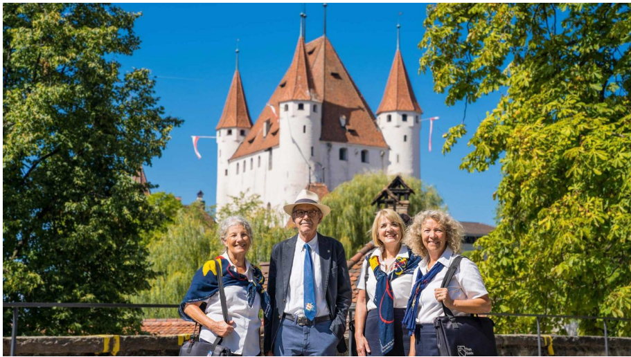
Interlaken Tourismus, Thun-Thunersee Tourismus - web@interlaketourism.ch