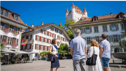
Interlaken Tourismus, Thun-Thunersee Tourismus - web@interlaketourism.ch