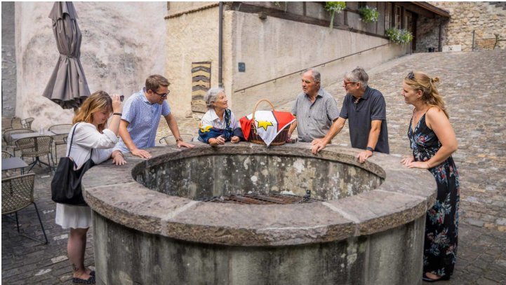
Interlaken Tourismus, Thun-Thunersee Tourismus - web@interlaketourism.ch