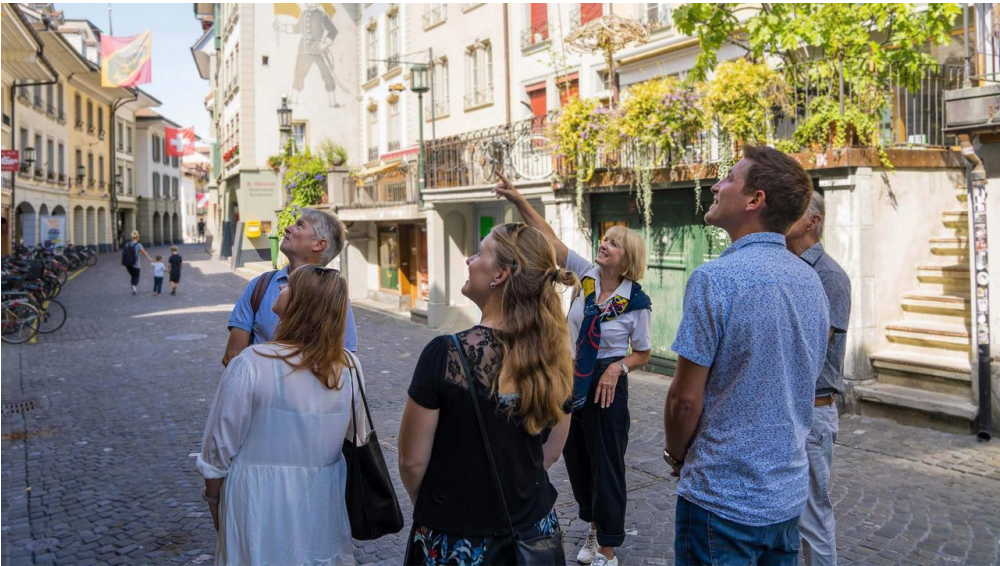
Interlaken Tourismus, Thun-Thunersee Tourismus - web@interlaketourism.ch

The guided tour can be booked in English, German, French and Italian.