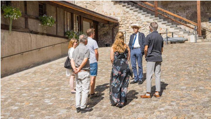
Interlaken Tourismus, Thun-Thunersee Tourismus - web@interlaketourism.ch