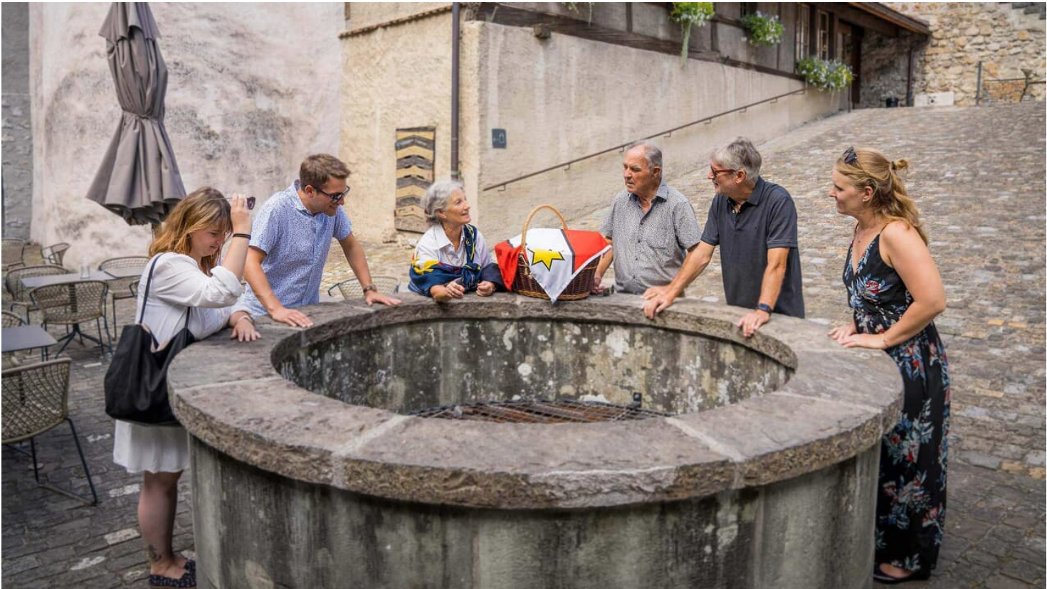
Interlaken Tourismus, Thun-Thunersee Tourismus - web@interlaketourism.ch