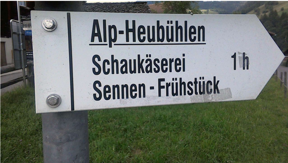
Alp Heubühlen