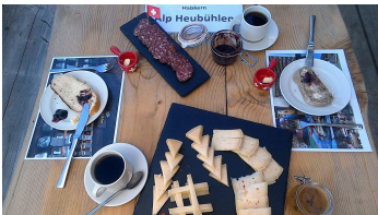
Alp Heubühlen