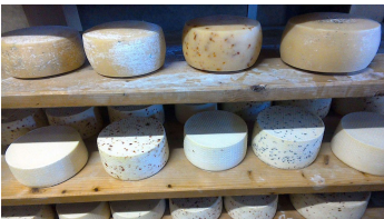
Alp Heubühlen