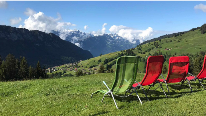
Alp Heubühlen