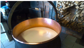
Alp Heubühlen