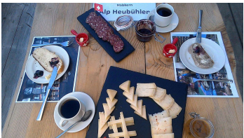
Alp Heubühlen