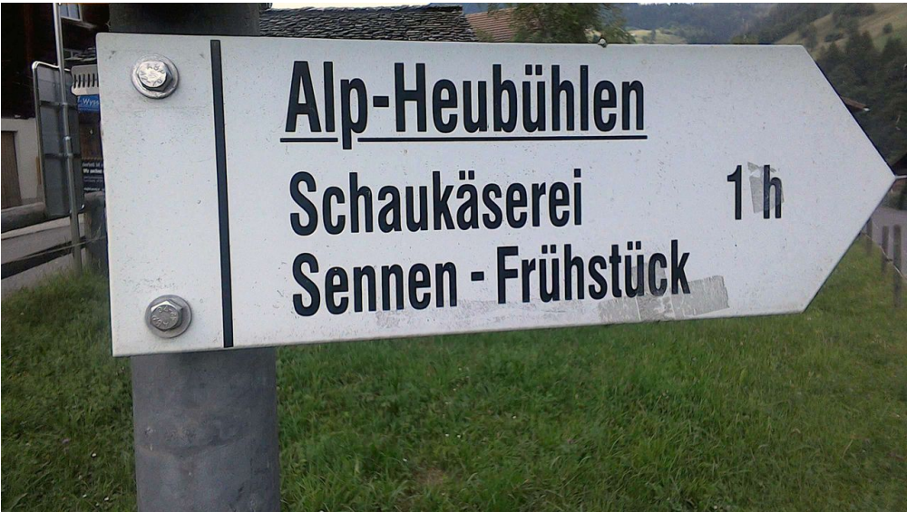
Alp Heubühlen

Openinghours Beginning of June – end of September