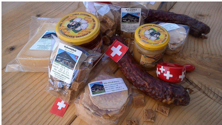
Alp Heubühlen