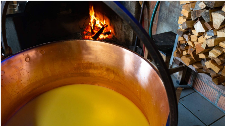
Alp Heubühlen