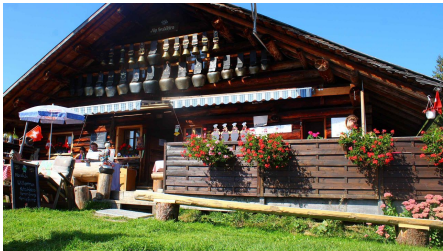
Alp Heubühlen