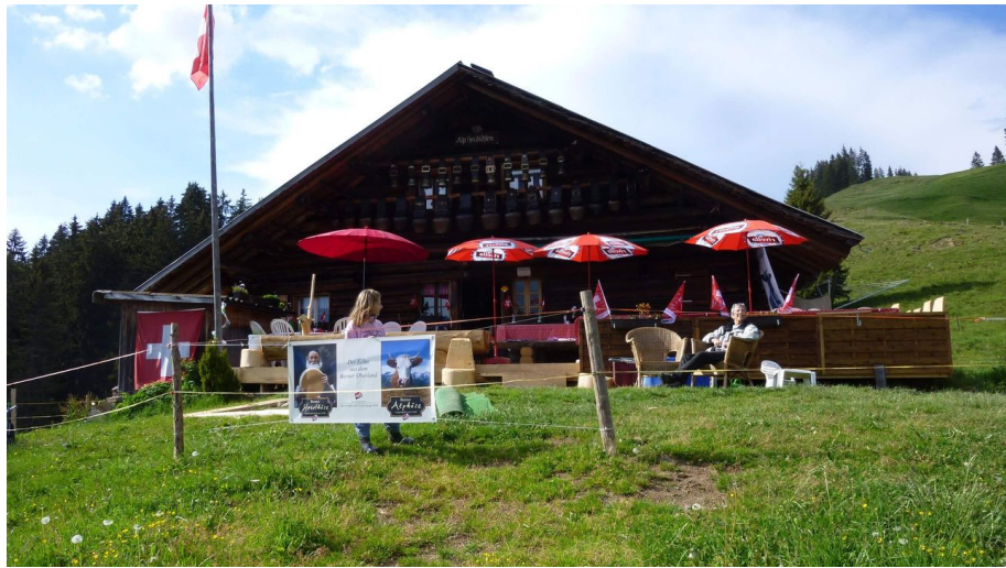
Alp Heubühlen

farm shop/direct sales guides alpine landscapes summer