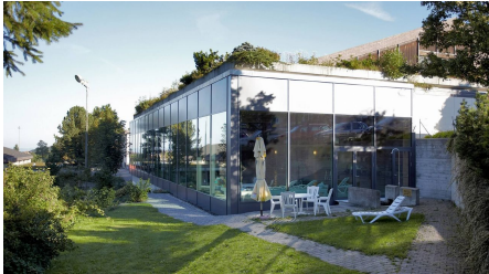
Hallenbad AG, Aeschi