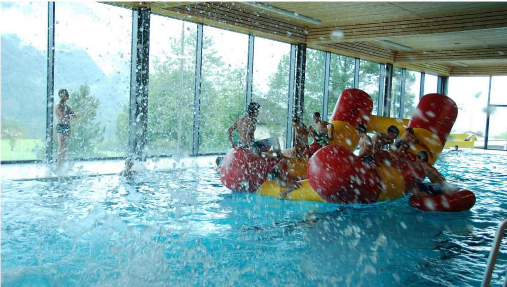
Hallenbad AG, Aeschi, Interlaken Tourismus - web@interlaketourism.ch