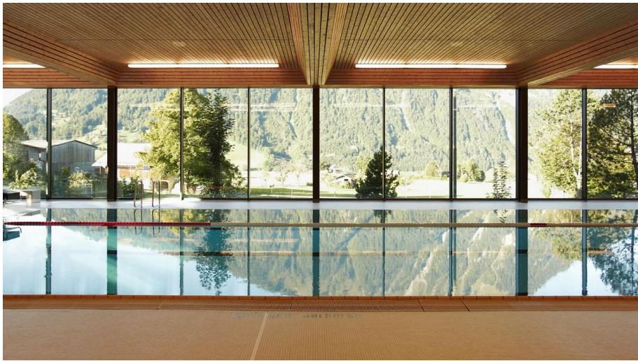
Hallenbad AG, Aeschi, Interlaken Tourismus - web@interlaketourism.ch