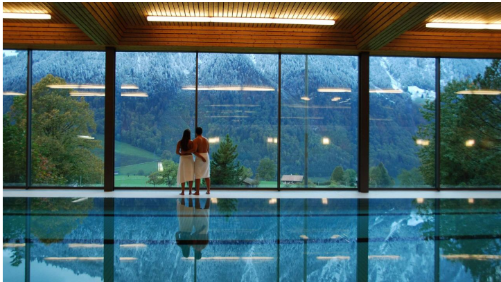
Hallenbad AG, Aeschi