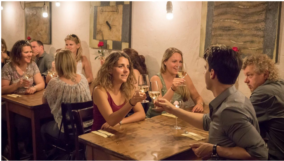
Thun-Thunersee Tourismus, Interlaken Tourismus - web@interlaketourism.ch