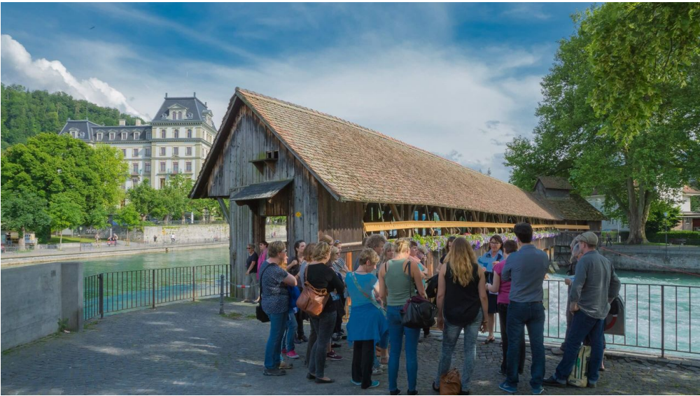
Thun-Thunersee Tourismus, Interlaken Tourismus - web@interlaketourism.ch

CHF 125 per person excl. drinks main course For group bookings min. 8 persons Ideal start time between 5.00 and 6.00 pm or at 11.00 am This tour can only be paid for on account.