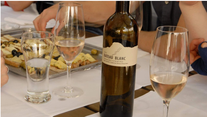
Thun-Thunersee Tourismus, Interlaken Tourismus - web@interlaketourism.ch