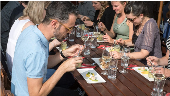
Thun-Thunersee Tourismus, Interlaken Tourismus - web@interlaketourism.ch