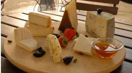
Thun-Thunersee Tourismus, Interlaken Tourismus - web@interlaketourism.ch