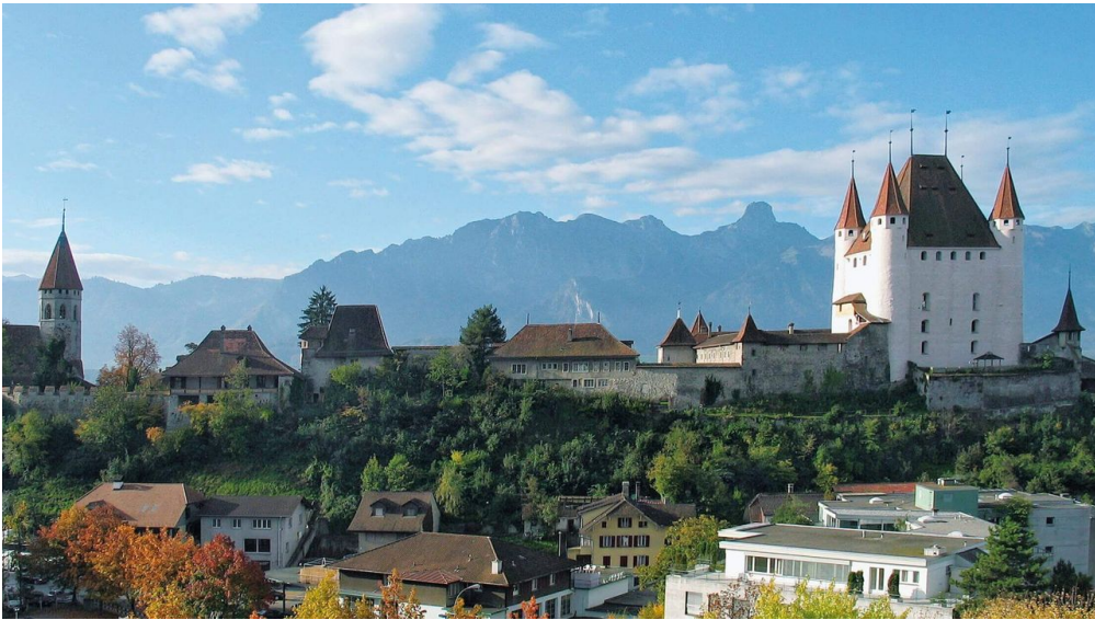
Thun-Thunersee Tourismus, Interlaken Tourismus - web@interlaktourism.ch