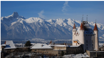
Thun-Thunersee Tourismus, Interlaken Tourismus - web@interlaktourism.ch