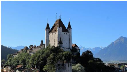
Thun-Thunersee Tourismus, Interlaken Tourismus - web@interlaktourism.ch