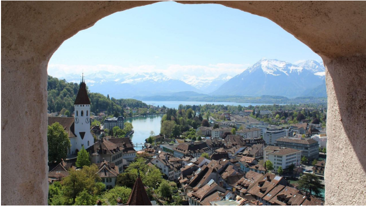
Thun-Thunersee Tourismus, Interlaken Tourismus - web@interlaktourism.ch