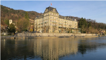
Thun-Thunersee Tourismus, Interlaken Tourismus - web@interlaktourism.ch