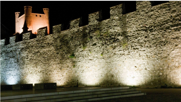
Thun-Thunersee Tourismus, Interlaken Tourismus - web@interlaktourism.ch