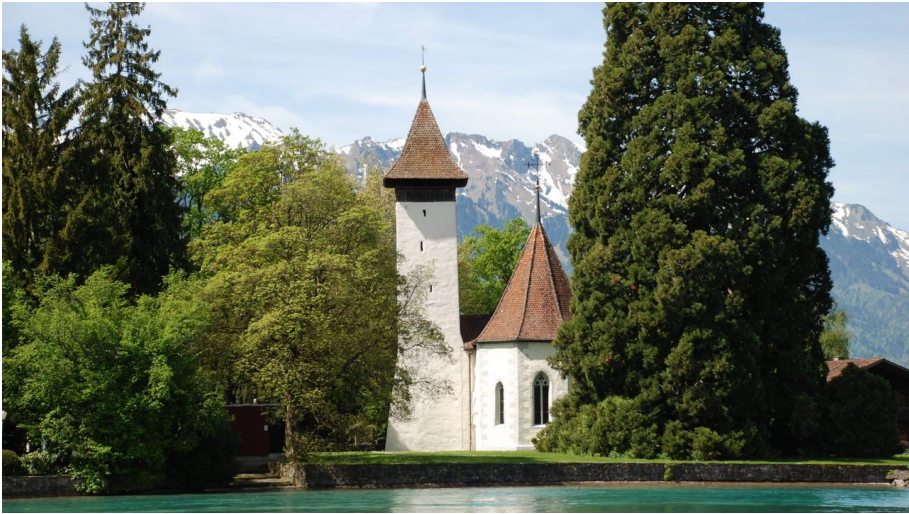
Thun-Thunersee Tourismus, Interlaken Tourismus - web@interlaketourism.ch