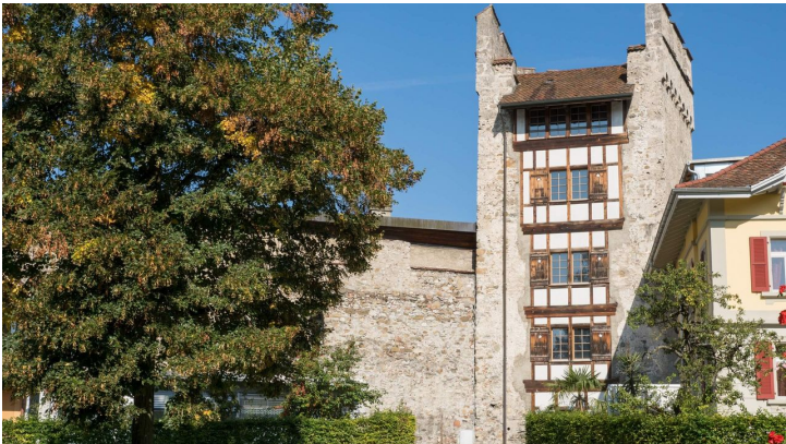
Thun-Thunersee Tourismus, Interlaken Tourismus - web@interlaktourism.ch