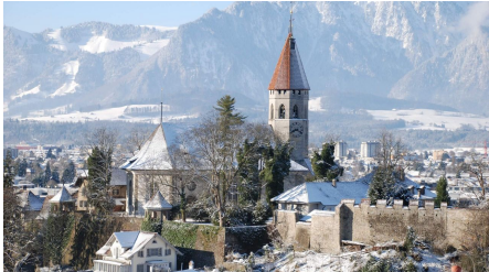
Thun-Thunersee Tourismus, Interlaken Tourismus - web@interlaktourism.ch