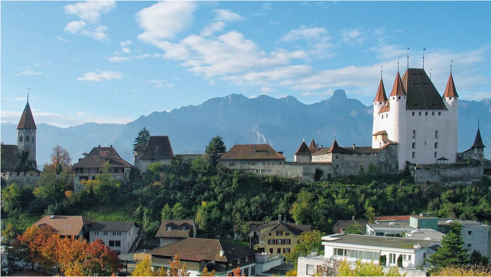
Schloss Thun

Suitable for any weather, for Groups, Suitable for the Elderly Payment Options Cash, Debit Card, Mastercard, Visa Accessibility / Arrival Parking available