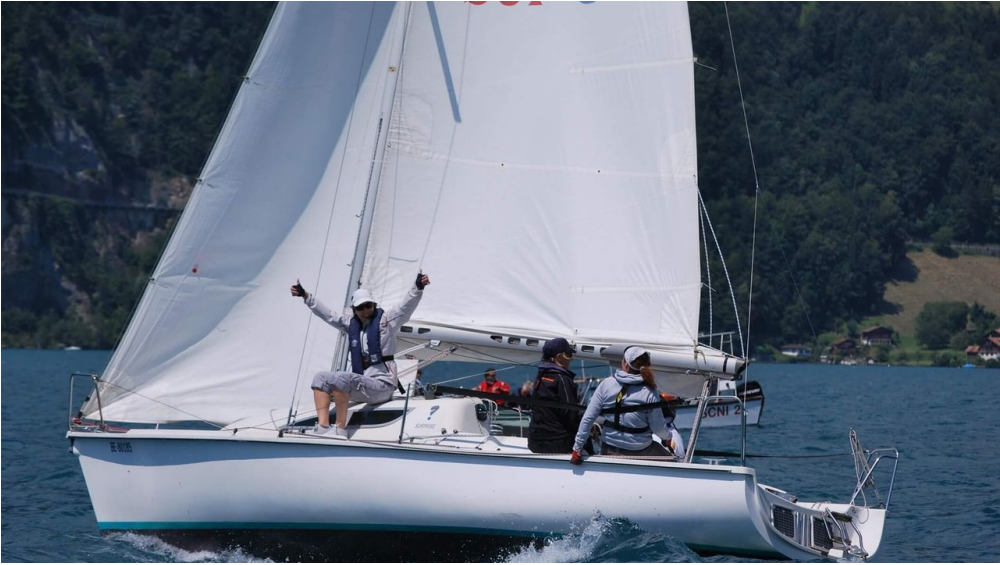
Segelschule Neuhaus