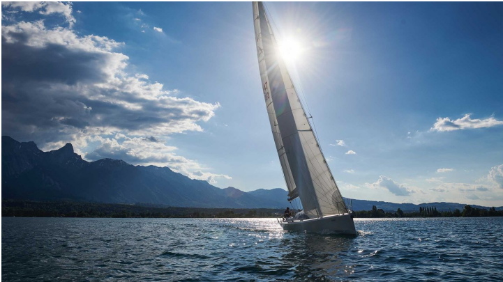
Segelschule Thunersee, Interlaken Tourismus - web@interlaketourism.ch