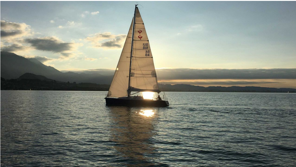
Segelschule Thunersee

Openinghours Thursday evening, May – September