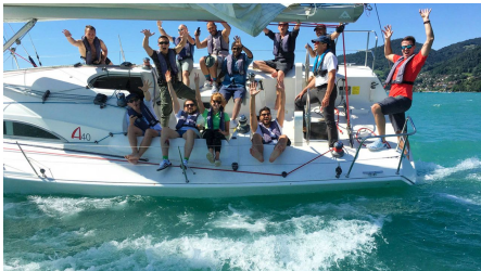
Segelschule Thunersee, Interlaken Tourismus - web@interlaketourism.ch