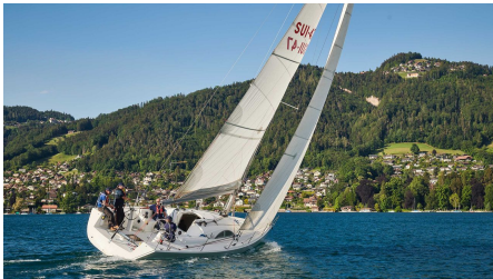
Segelschule Thunersee