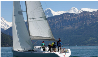
Segelschule Thunersee