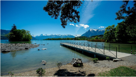
Interlaken Tourismus - web@interlaketourism.ch