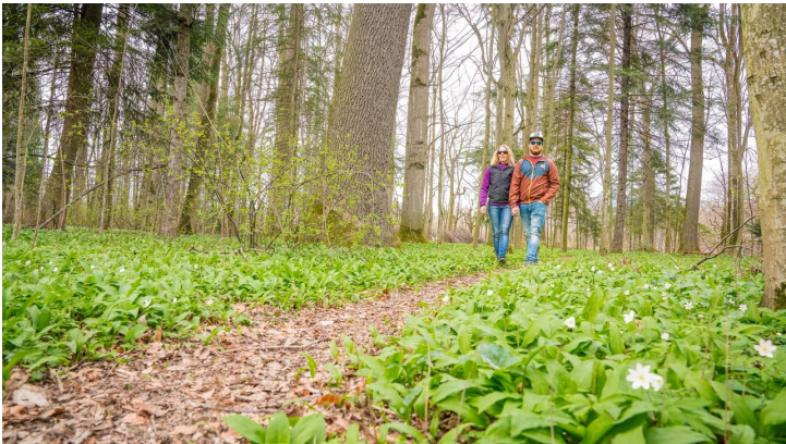
Interlaken Tourismus - web@interlaketourism.ch