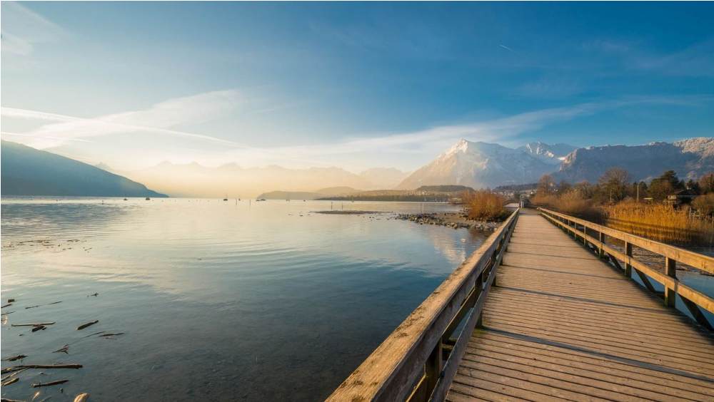
Hotel Interlaken AG, Interlaken Tourismus - web@interlaketourism.ch