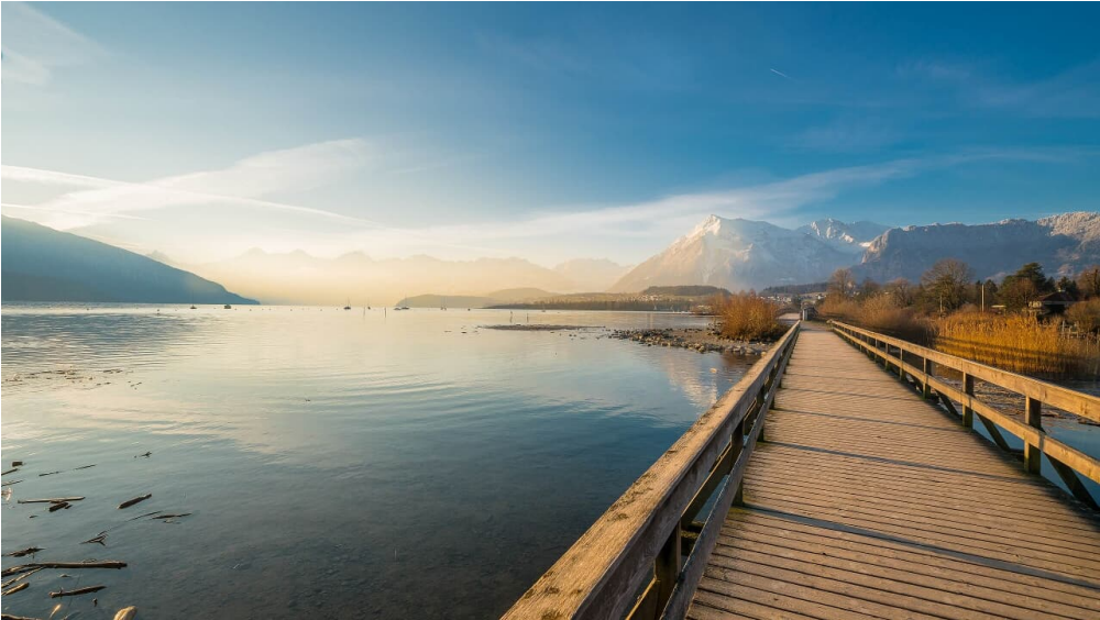
Hotel Interlaken AG, Interlaken Tourismus - web@interlaketourism.ch