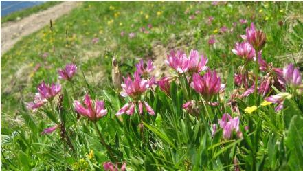
Interlaken Tourismus - web@interlaketourism.ch