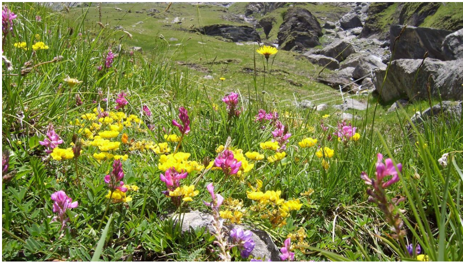
Interlaken Tourismus - web@interlaketourismus.ch

nature reserves guides places of power summer