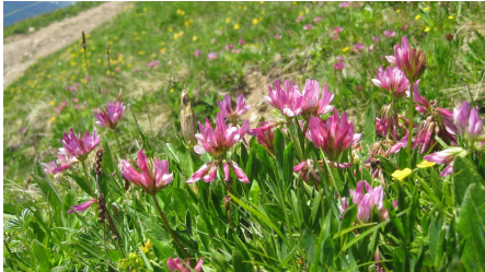
Interlaken Tourismus - web@interlaketourism.ch