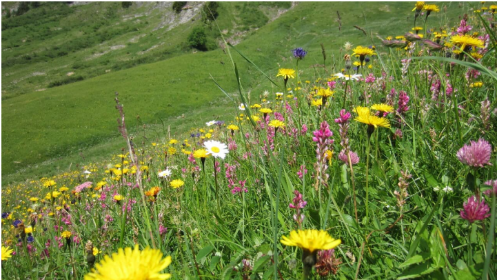
Interlaken Tourismus - web@interlaketourism.ch