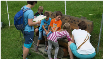
Aeschi Tourismus, Interlaken Tourismus - web@interlaketourism.ch