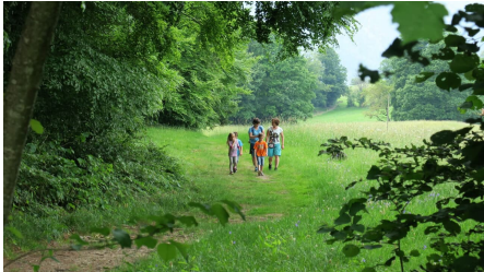
Aeschi Tourismus, Interlaken Tourismus - web@interlaketourism.ch