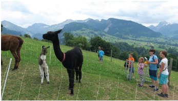
Aeschi Tourismus, Interlaken Tourismus - web@interlaketourism.ch