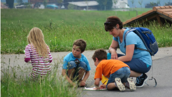
Aeschi Tourismus, Interlaken Tourismus - web@interlaketourism.ch