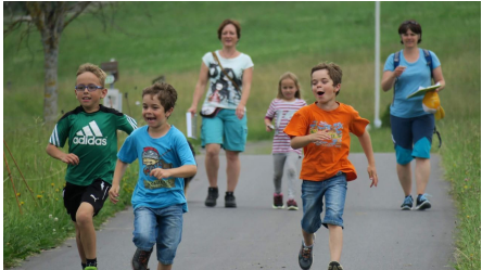
Aeschi Tourismus, Interlaken Tourismus - web@interlaketourism.ch