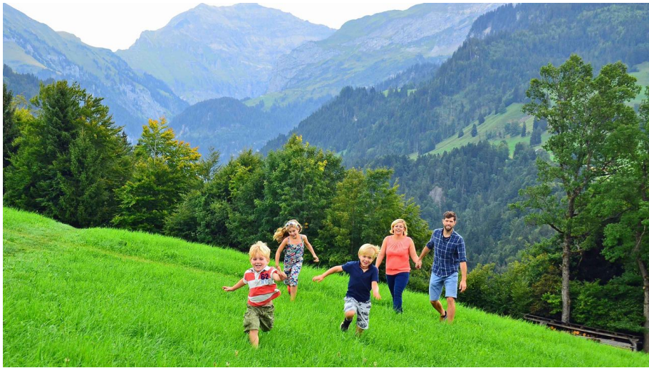
Aeschi Tourismus, Interlaken Tourismus - web@interlaketourism.ch

scavenger hunt theme trails summer winter