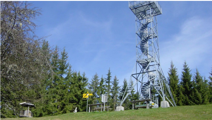
Tourismus-Organisation Interlaken, Interlaken Tourismus - web@interlaketourism.ch