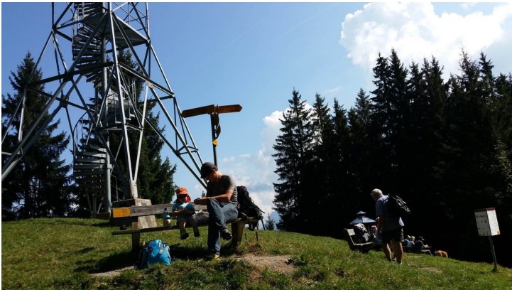
Tourismus-Organisation Interlaken, Interlaken Tourismus - web@interlaketourism.ch