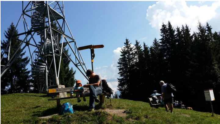
Tourismus-Organisation Interlaken, Interlaken Tourismus - web@interlaketourism.ch