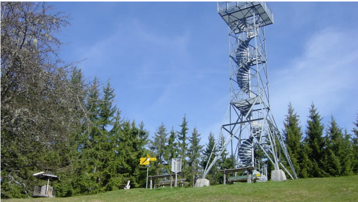
Tourismus-Organisation Interlaken, Interlaken Tourismus - web@interlaketourism.ch