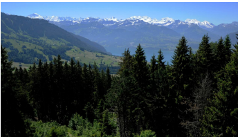
Tourismus-Organisation Interlaken, Interlaken Tourismus - web@interlaketourism.ch