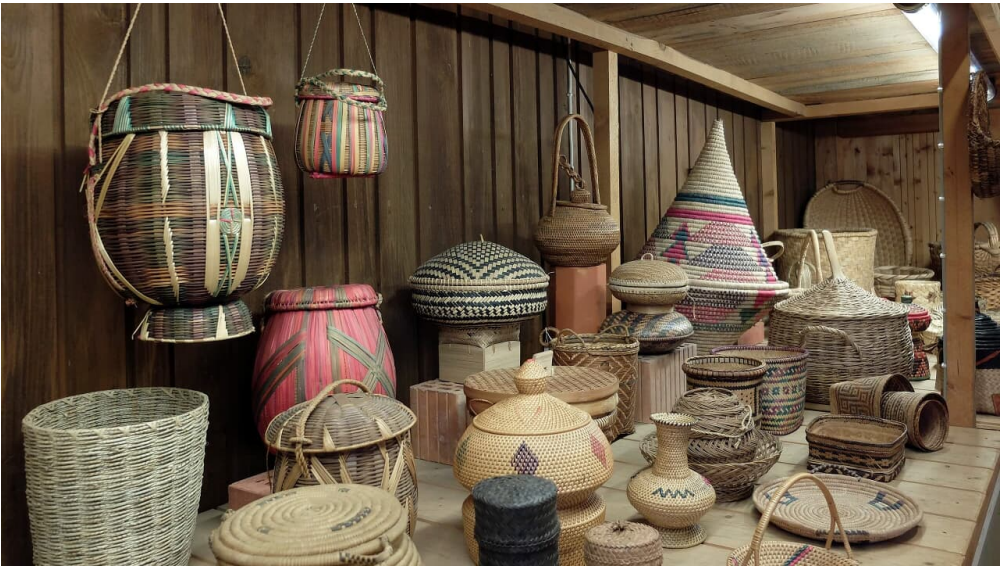
Flechtmuseum Thun, Interlaken Tourismus - web@interlaketourismus.ch

_____ April – October every 4th weekend open (1.00 pm – 5.00 pm) By appointment, the museum and the wickerwork workshop can also be visited outside official opening hours