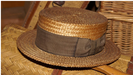
Flechtmuseum Thun