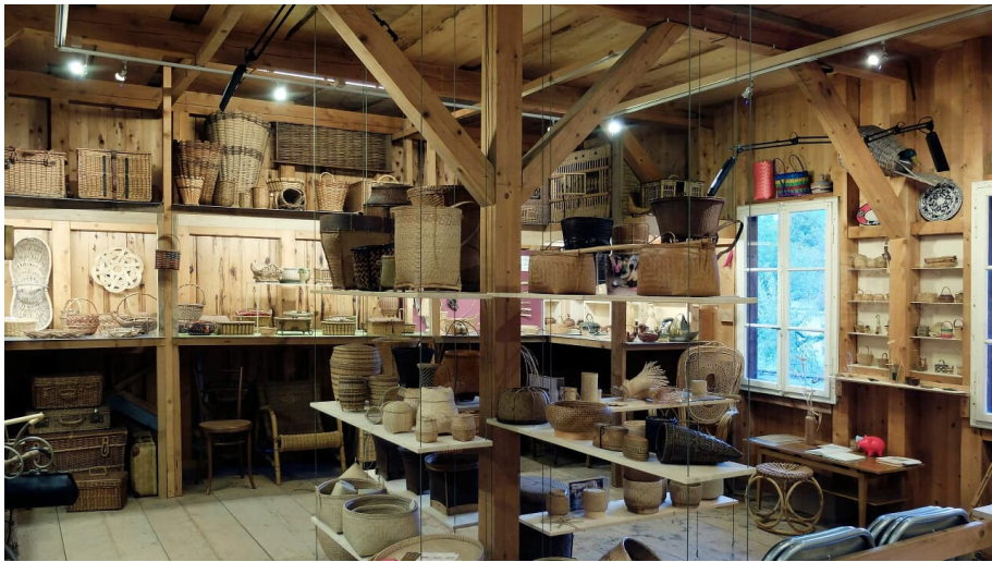
Flechtmuseum Thun