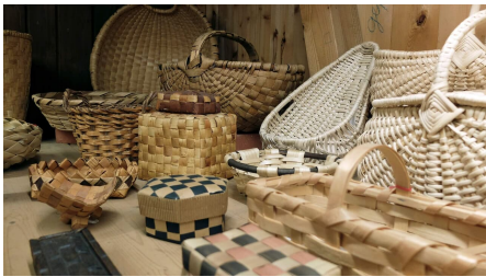
Flechtmuseum Thun