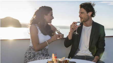
BLS AG, Interlaken Tourismus - web@interlaketourism.ch