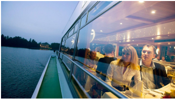
BLS AG, Interlaken Tourismus - web@interlaktourism.ch