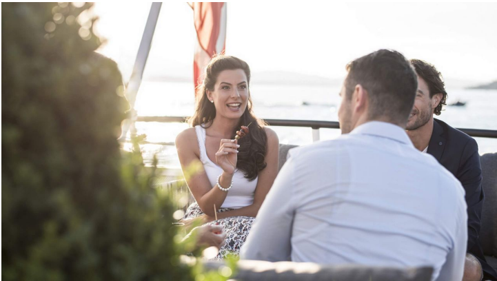
BLS AG, Interlaken Tourismus - web@interlaktourism.ch