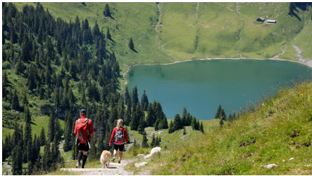
Stockhornbahn AG, Interlaken Tourismus - web@interlaketourism.ch