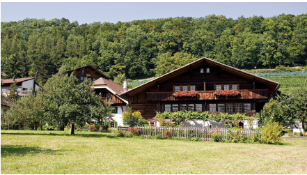
Heimat-und Rebbaumuseum