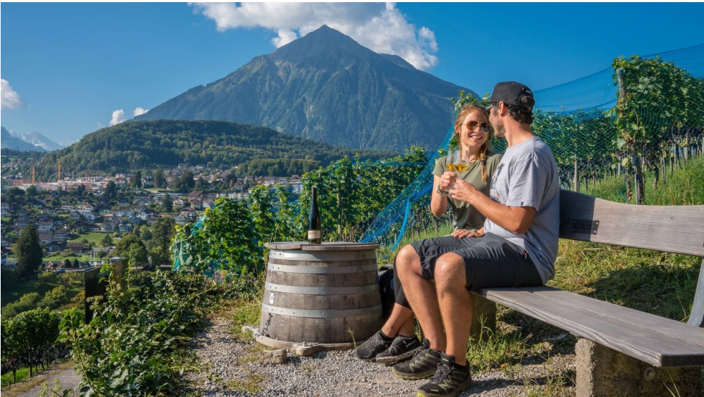
Heimat-und Rebbaumuseum, Interlaken Tourismus - web@interlaketourism.ch

May - October Saturday and Sunday from 14.00 to 17.00 h