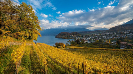
Heimat-und Rebbaumuseum, Interlaken Tourismus - web@interlaketourism.ch