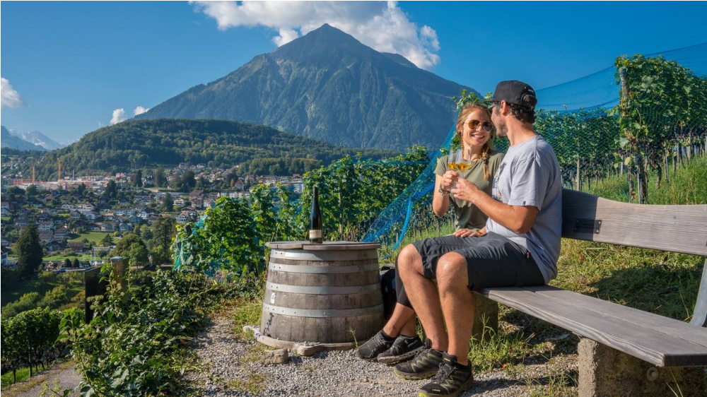
Heimat-und Rebbaumuseum, Interlaken Tourismus - web@interlaketourism.ch

May - October Saturday and Sunday from 14.00 to 17.00 h