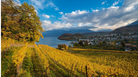
Heimat-und Rebbaumuseum