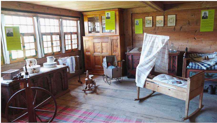
Heimat-und Rebbaumuseum