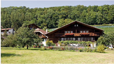
Heimat-und Rebbaumuseum, Interlaken Tourismus - web@interlaketourism.ch