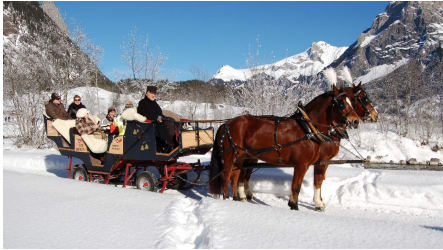
Aeschi Tourismus, Interlaken Tourismus - web@interlaketourism.ch