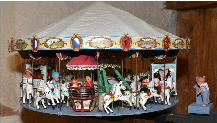
Museum für Uhren und mechanische Musikinstrumente MUMM