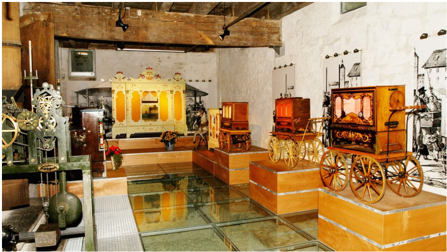
Museum für Uhren und mechanische Musikinstrumente MUMM