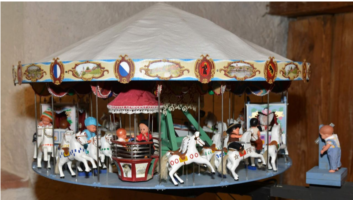
Museum für Uhren und mechanische Musikinstrumente MUMM