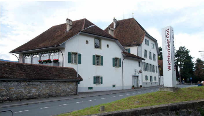
Museum für Uhren und mechanische Musikinstrumente MUMM

Beginning of May - end of October from Tuesday to Sunday 14.00 – 17.00h