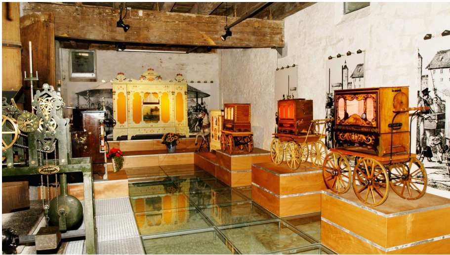
Museum für Uhren und mechanische Musikinstrumente MUMM, Interlaken Tourismus - web@interlaketourism.ch