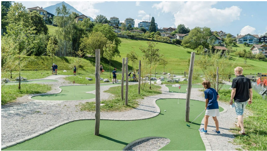
Spiez Marketing AG, Interlaken Tourismus - web@interlaketourism.ch