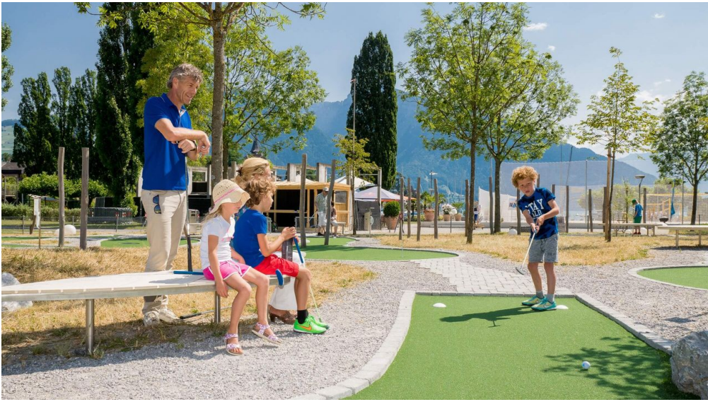
Jungfrauzeitung (www.jungfrauzeitung.ch), Interlaken Tourismus - web@interlaktourism.ch