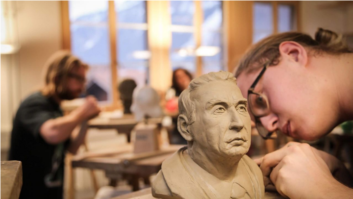
Schule für Holzbildhauerei Brienz