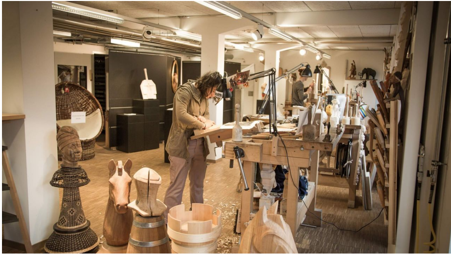
Schule für Holzbildhauerei Brienzen