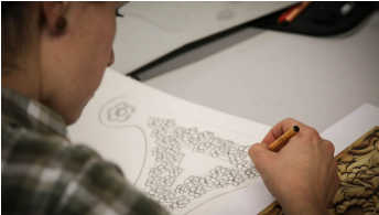
Schule für Holzbildhauerei Brienz