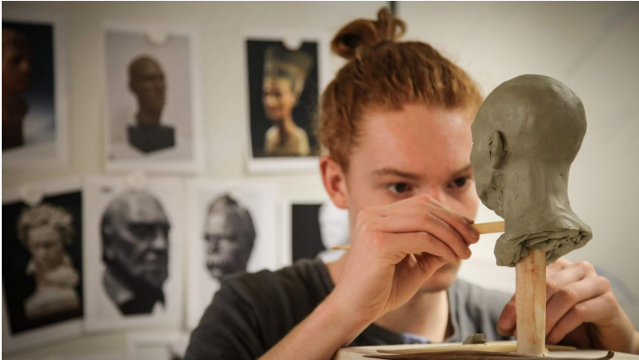
Schule für Holzbildhauerei Brienz