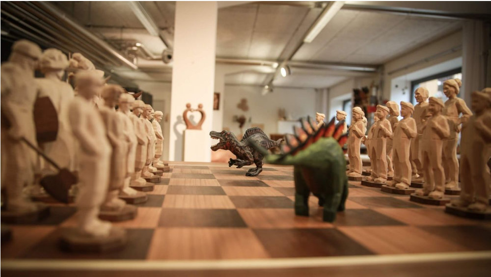
Schule für Holzbildhauerei Brienz, Interlaken Tourismus - web@interlaketourism.ch

Monday – Thursday 08.00 – 11.30 h / 14.00 – 17.00 h Friday 08.00 – 11.30 h / 14.00 – 15.00 h The exhibition is closed on public holidays and during school holidays. www.holzbildhauerei.ch/de/Info/Ausstellung