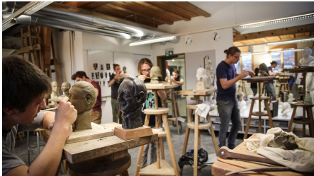
Schule für Holzbildhauerei Brienz