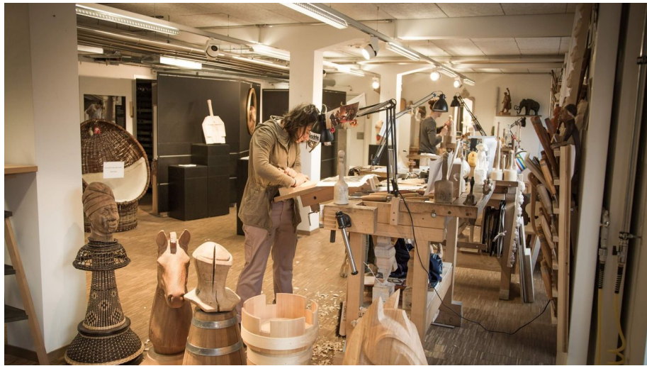
Schule für Holzbildhauerei Brienzi