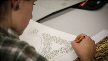
Schule für Holzbildhauerei Brienz