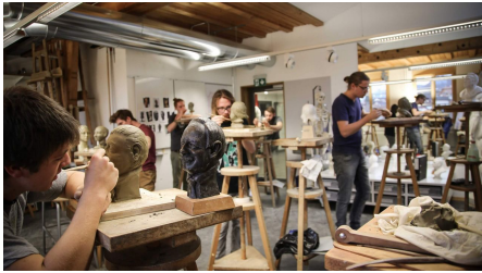
Schule für Holzbildhauerei Brienz