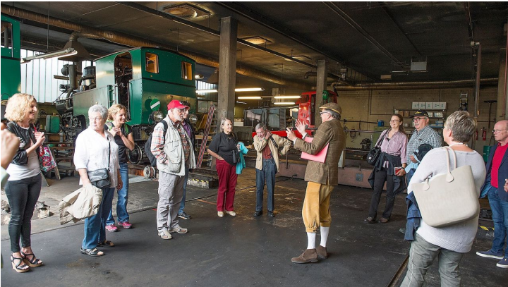
Brien Rothorn Bahn