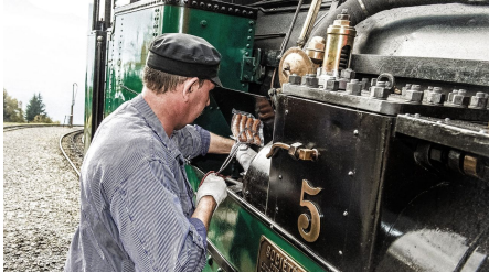
Brien Rothorn Bahn, Interlaken Tourismus - web@interlaketourism.ch