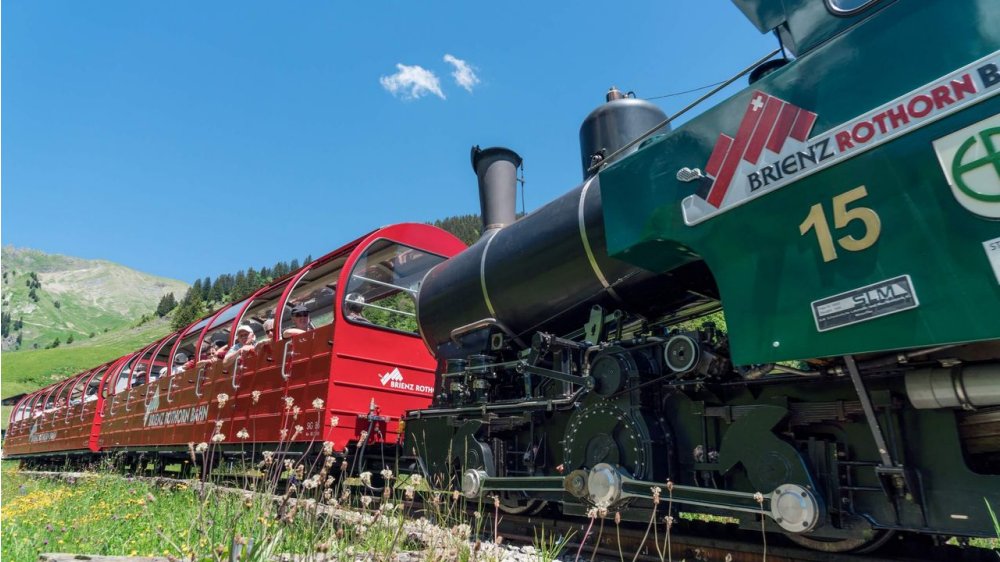
Brien Rothorn Bahn