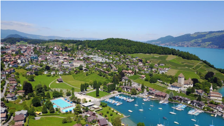
Spiez Marketing AG, Interlaken Tourismus - web@interlaketourism.ch