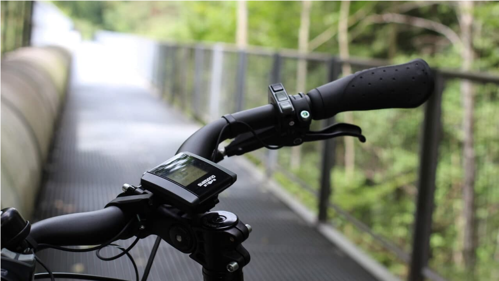
Spiez Marketing AG, Interlaken Tourismus - web@interlaketourism.ch

_____ Please note the opening hours of the Info-Center Spiez.