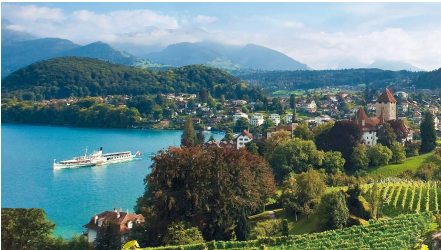
Spiez Marketing AG, Interlaken Tourismus - web@interlaketourism.ch