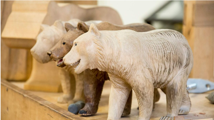
Schweizer Holzbildhauerei Museum