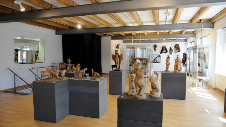
Schweizer Holzbildhauerei Museum, Interlaken Tourismus - web@interlaketourism.ch