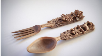
Schweizer Holzbildhauerei Museum, Interlaken Tourismus - web@interlaketourism.ch