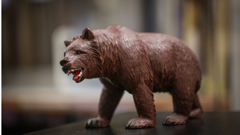
Schweizer Holzbildhauerei Museum