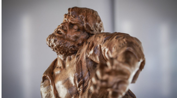
Schweizer Holzbildhauerei Museum, Interlaken Tourismus - web@interlaketourism.ch