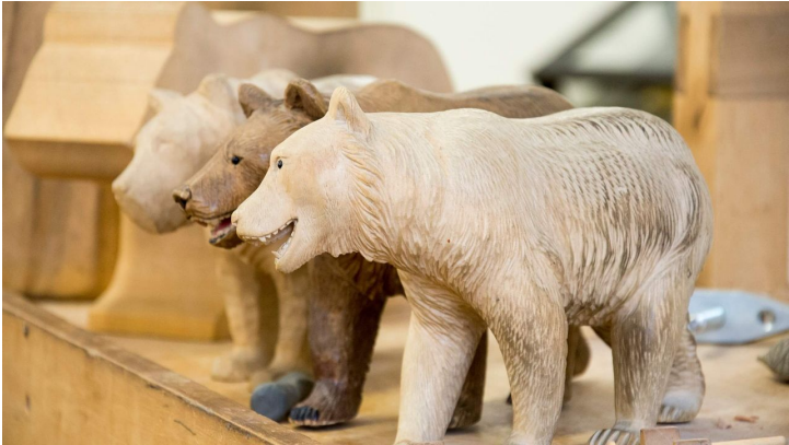
Schweizer Holzbildhauerei Museum, Interlaken Tourismus - web@interlaketourism.ch