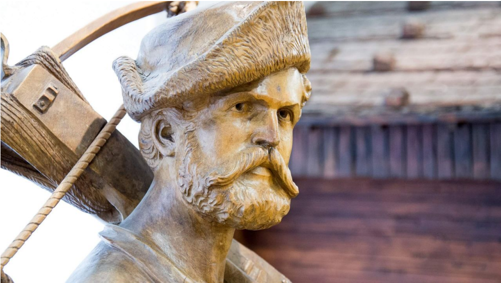
Schweizer Holzbildhauerei Museum, Interlaken Tourismus - web@interlaketourism.ch

May – October every Wednesday to Sunday Guided tour and cow carving events available on request for groups during winter