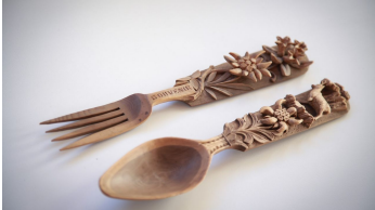
Schweizer Holzbildhauerei Museum