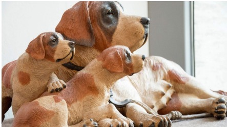
Schweizer Holzbildhauerei Museum