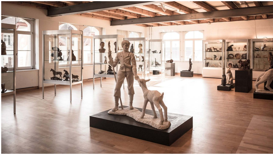
Interlaken Tourismus, Schweizer Holzbildhauerei Museum - web@interlaketourism.ch

museums craft Disability Access summer souvenirs