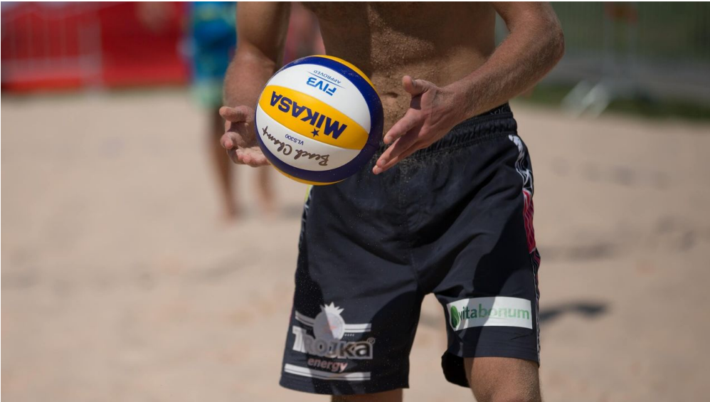
Spiez Marketing AG, Interlaken Tourismus - web@interlaketourism.ch