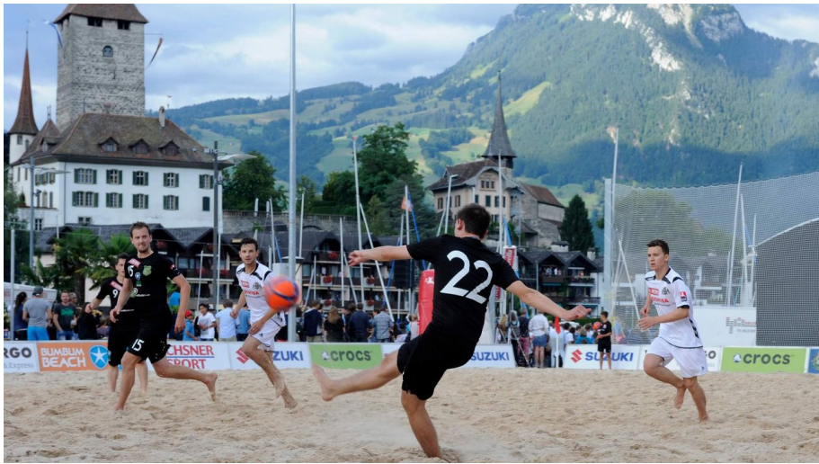
Spiez Marketing AG, Interlaken Tourismus - web@interlaketourism.ch