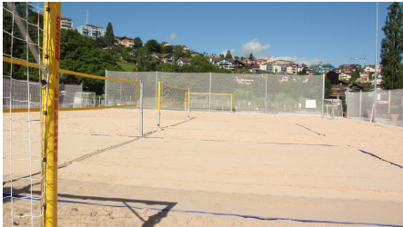
Spiez Marketing AG, Interlaken Tourismus - web@interlaketourism.ch