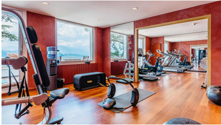
BEATUS Wellness