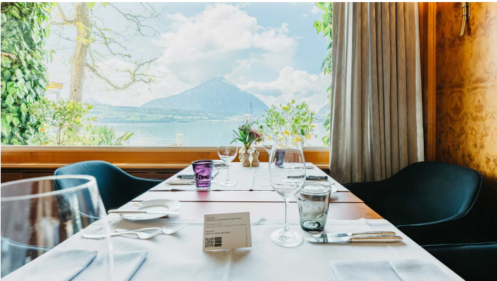
BEATUS Wellness- , Interlaken Tourismus - web@interlaketourism.ch