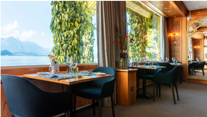
BEATUS Wellness