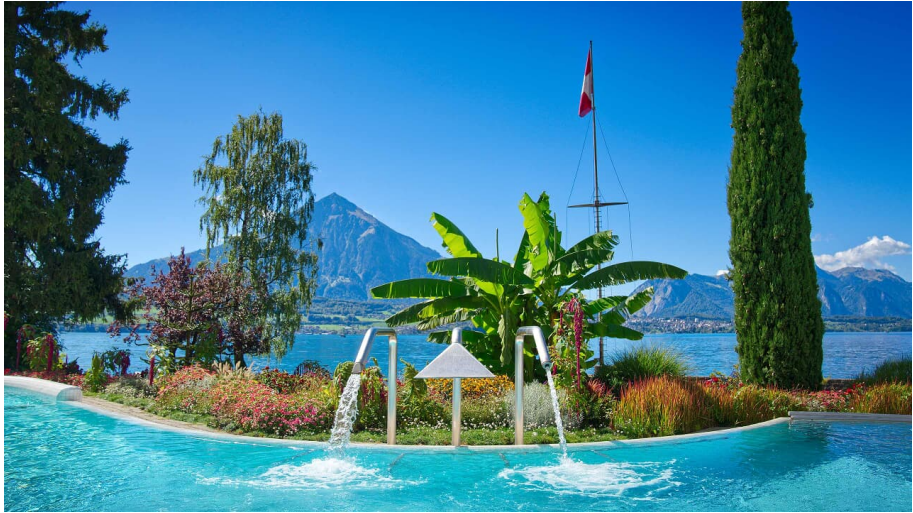
BEATUS Wellness