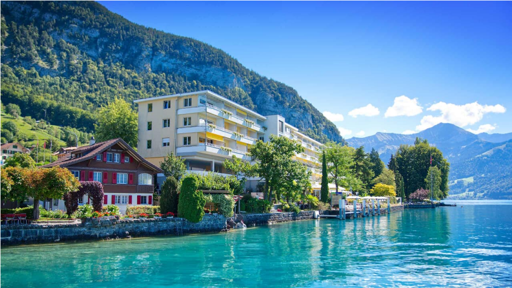
BEATUS Wellness