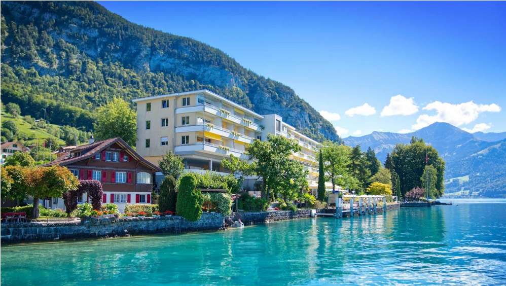
BEATUS Wellness- , Interlaken Tourismus - web@interlaketourism.ch