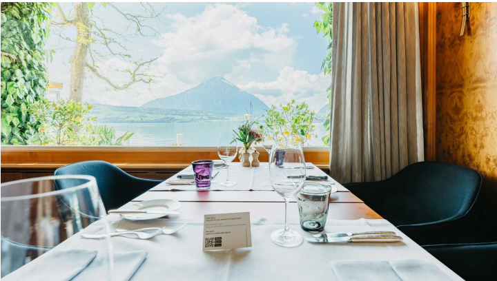
BEATUS Wellness