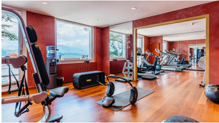
BEATUS Wellness