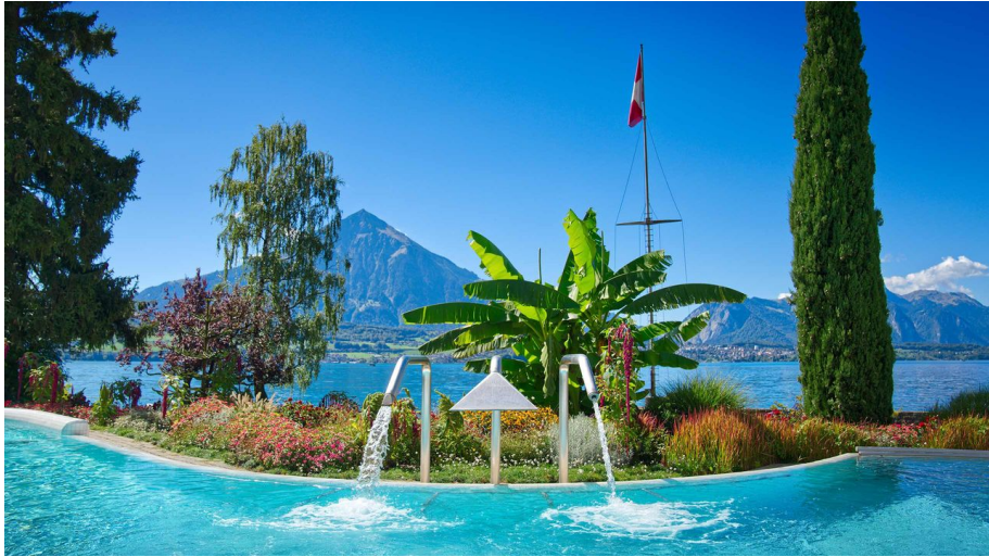
BEATUS Wellness