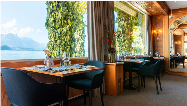
BEATUS Wellness