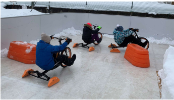
Beatenberg Tourismus, Interlaken Tourismus - web@interlaktourism.ch