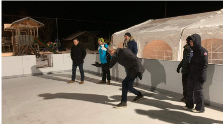
Beatenberg Tourismus, Interlaken Tourismus - web@interlaktourism.ch