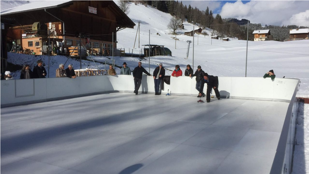
Beatenberg Tourismus, Interlaken Tourismus - web@interlaktourism.ch