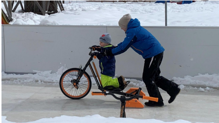
Beatenberg Tourismus, Interlaken Tourismus - web@interlaktourism.ch