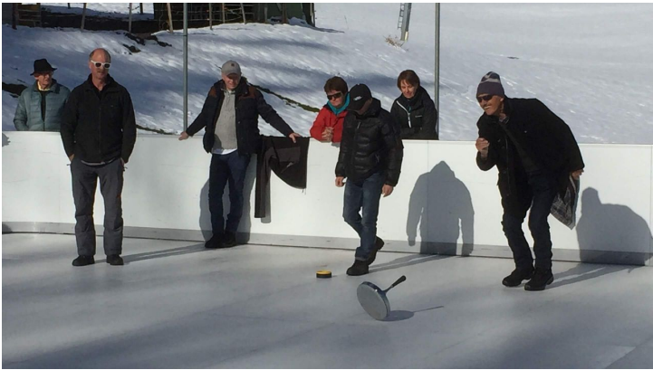
Beatenberg Tourismus, Interlaken Tourismus - web@interlaktourism.ch