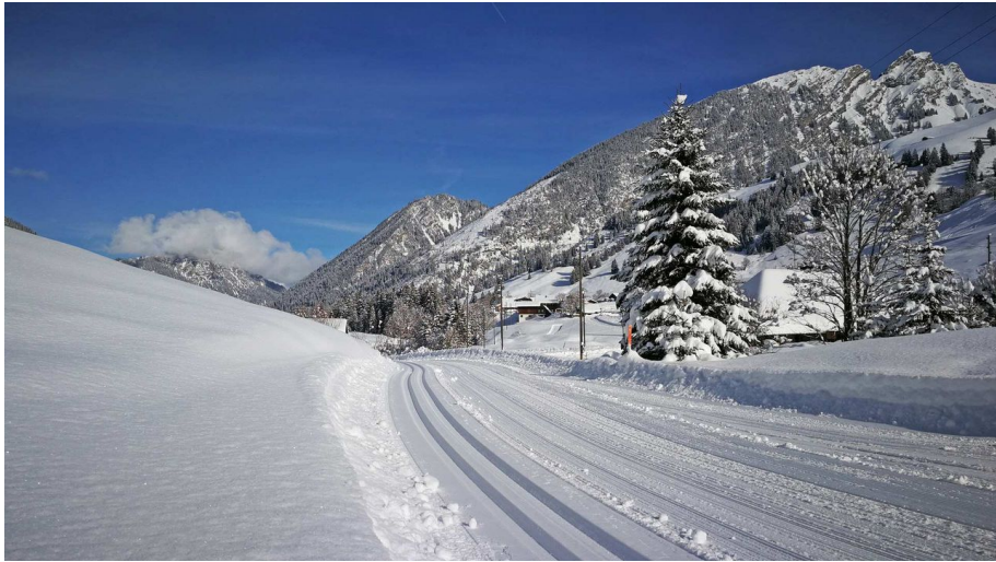
Naturpark Diemtigtal

cross-country skiing nature park alpine landscapes winter