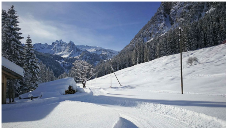
Naturpark Diemtigtal, Interlaken Tourismus - web@interlaktourism.ch