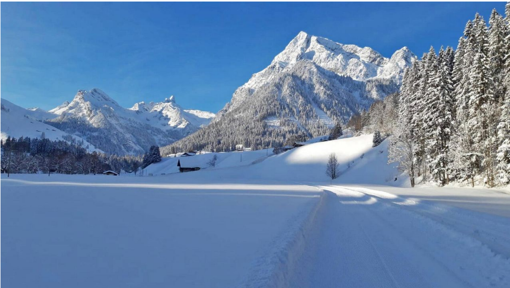
Naturpark Diemtigtal, Interlaken Tourismus - web@interlaktourism.ch