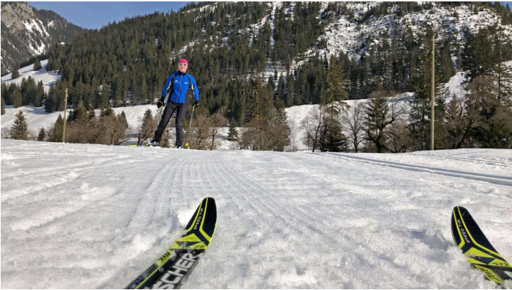
Naturpark Diemtigtal