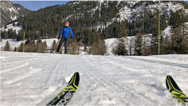
Naturpark Diemtigtal, Interlaken Tourismus - web@interlaketourism.ch