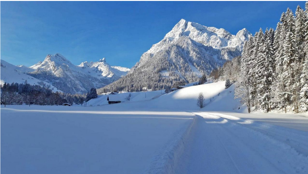
Naturpark Diemtigtal, Interlaken Tourismus - web@interlaketourism.ch